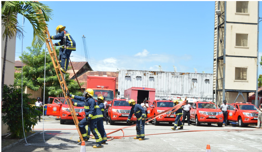
Fire officers demonstrate the use of the new ladders during the commissioning of new utility vehicles (in background) and ladders at the Fire Service Headquarters, Wrightson Road, Port-of-Spain, yesterday.