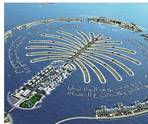
Villas For Sale in Dubai Might Surprise You