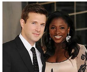
[Pics] These Are The Wives Of The World's Richest Men Highlly